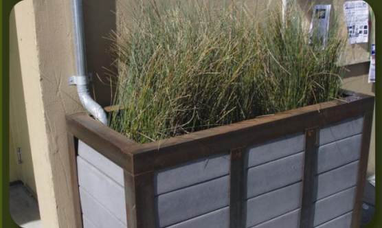
New Seasons Market Portland, OR