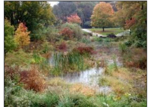
Saylor Grove Stormwater Wetland