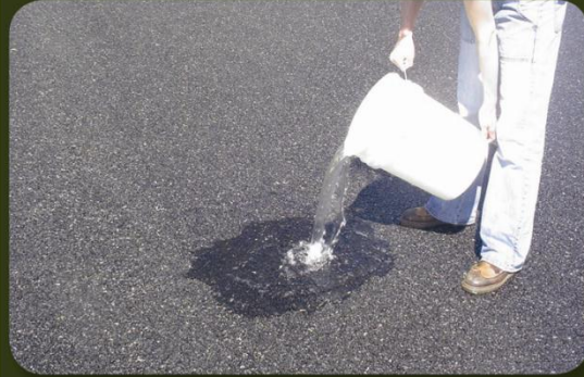
Mill Creek Basketball Court Philadelphia, PA