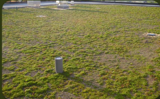
PECO Building, Philadelphia, PA