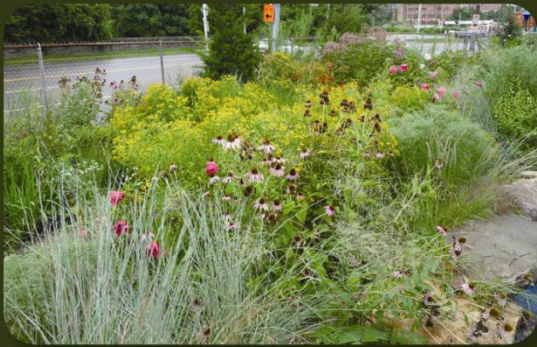
Wissahickon Charter School Philadelphia, PA