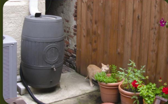
Row home, Philadelphia, PA