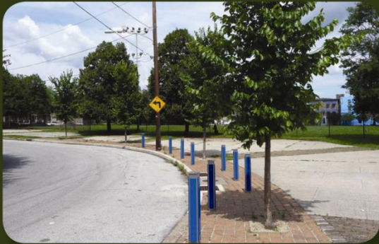
West Mill Creek, Philadelphia, PA