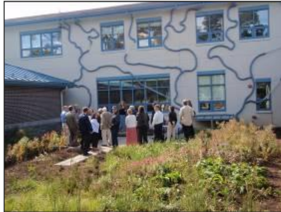
Springside School "Water Wall" and Rain Garden