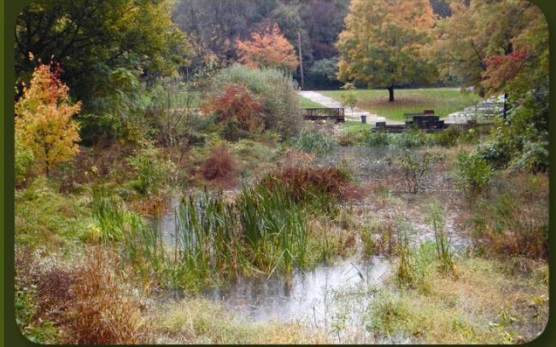
Saylor Grove, Philadelphia, PA