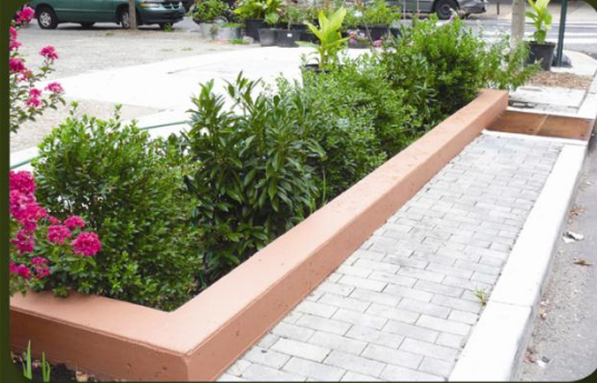
Columbus Square, Philadelphia, PA