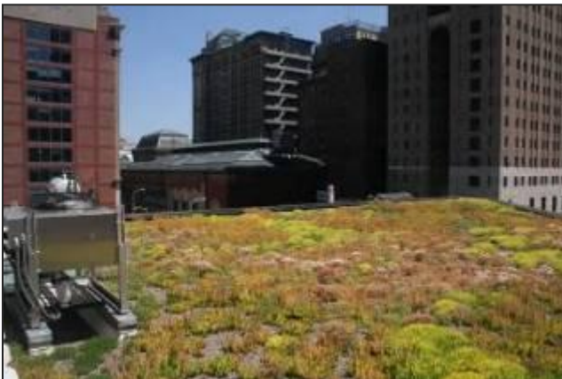
Friends Center Green Roof