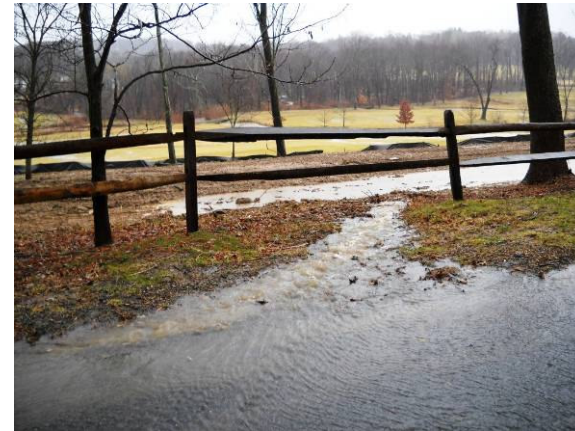
300 feet by 8 feet by 6 feet (deep) infiltration trench